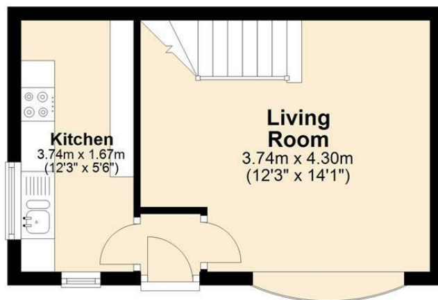
Ground Floor Approx. 23.0 sq. metres (247.4 sq. feet)